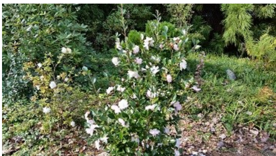
Camellia In Bloom