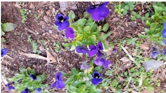
Newly-Planted Purple Pansies