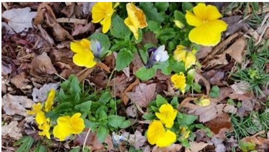
Newly-Planted Yellow Pansies