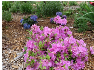
A couple of favorite pictures