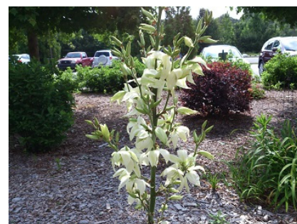
The Yucca bloomed for the first time in three summers