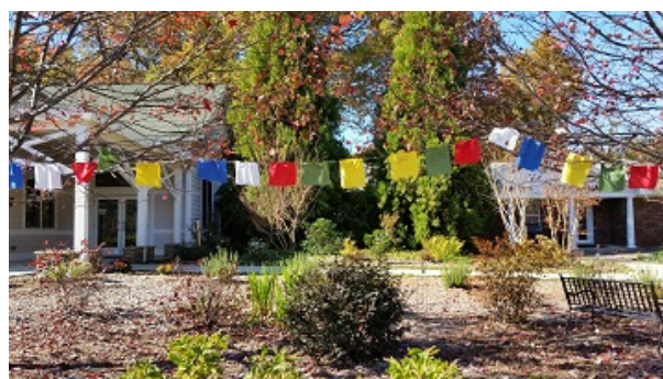
Tibetan Prayer Flags were added by MCY