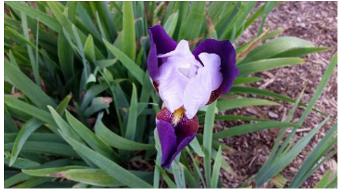
Deep Purple Irises