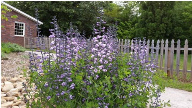
April Showers Brought Purple Flowers