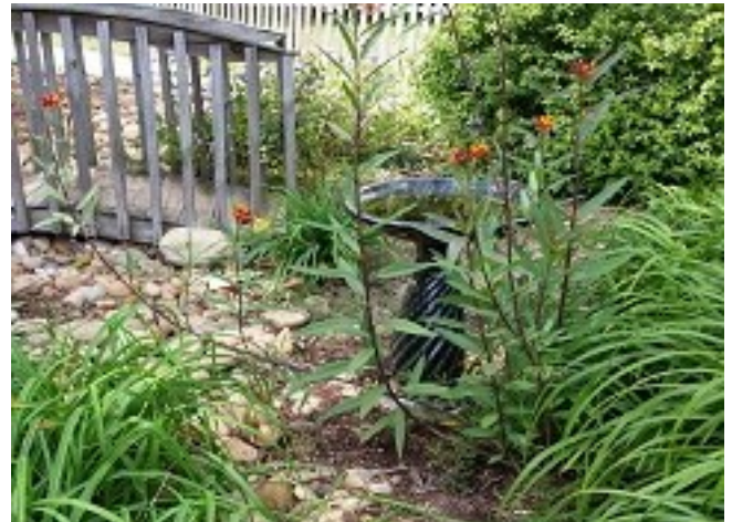
A Yellow Butterfly on the Butterfly Weed