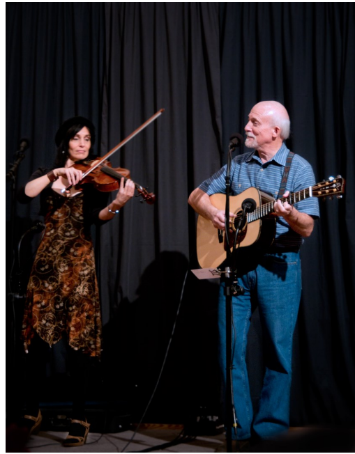
Out of the Rain