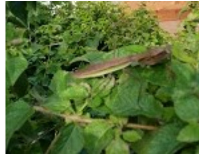
A Praying Mantis on the Lantana