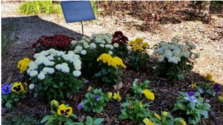
A Fall Planting in the Meditation Garden