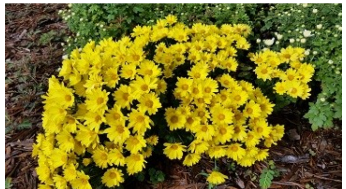
The Yellow Mums Finally Bloom