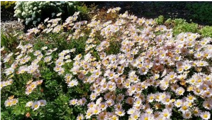
A Field of Daisy Mums