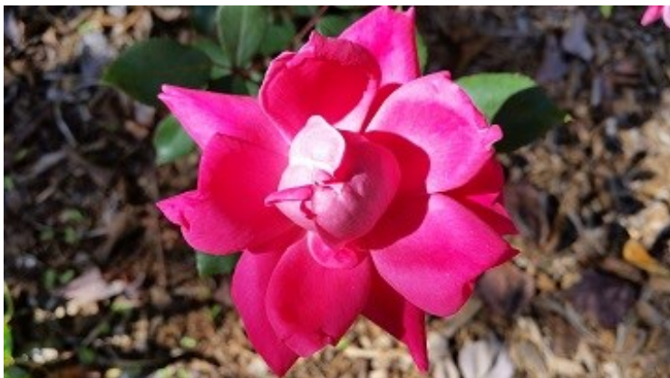
A Perfect Rose