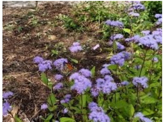
A Monarch Butterfly on the Ageratum