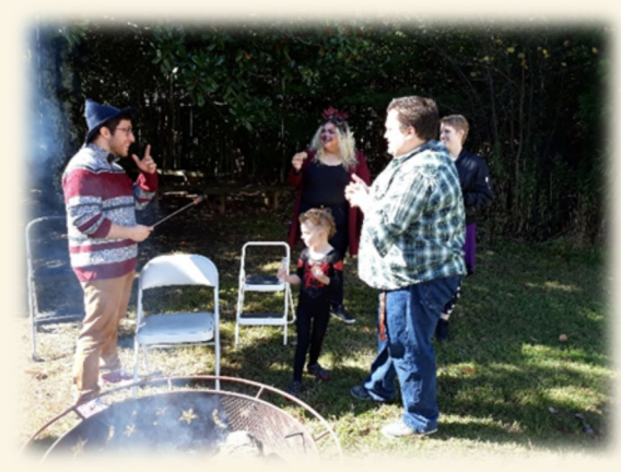
Young Adults Discussing the Proper Way to Make and Eat S'mores

Special "Thank You(s)" to all those in the MCY program who planned the event - especially the teachers and children and youth from the 6th - 7th grades, Coming of Age and Senior Youth. It was truly a cooperative effort and a scary time was had by all!